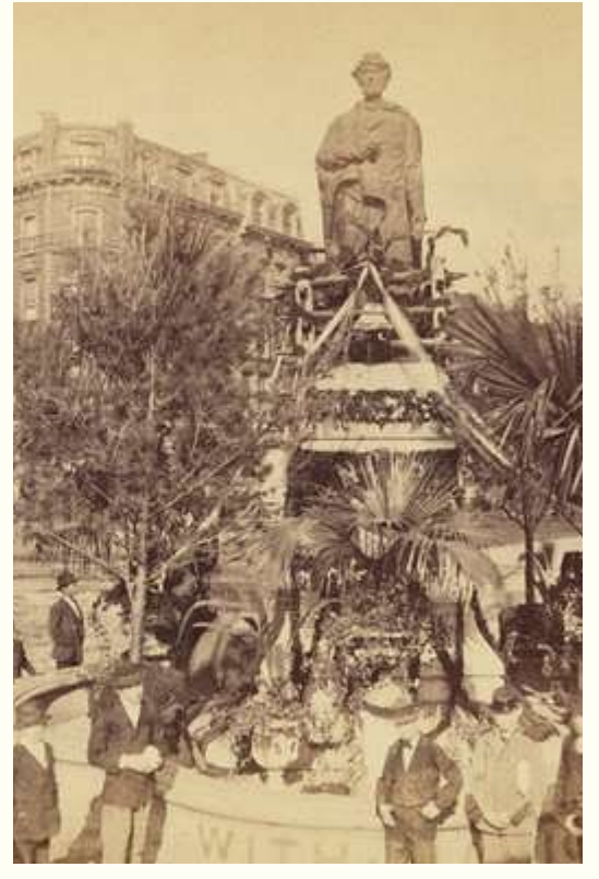
STATUE OF ABRAHAM LINCOLN IN UNION SQUARE DECORATED FOR MEMORIAL DAY IN 1876